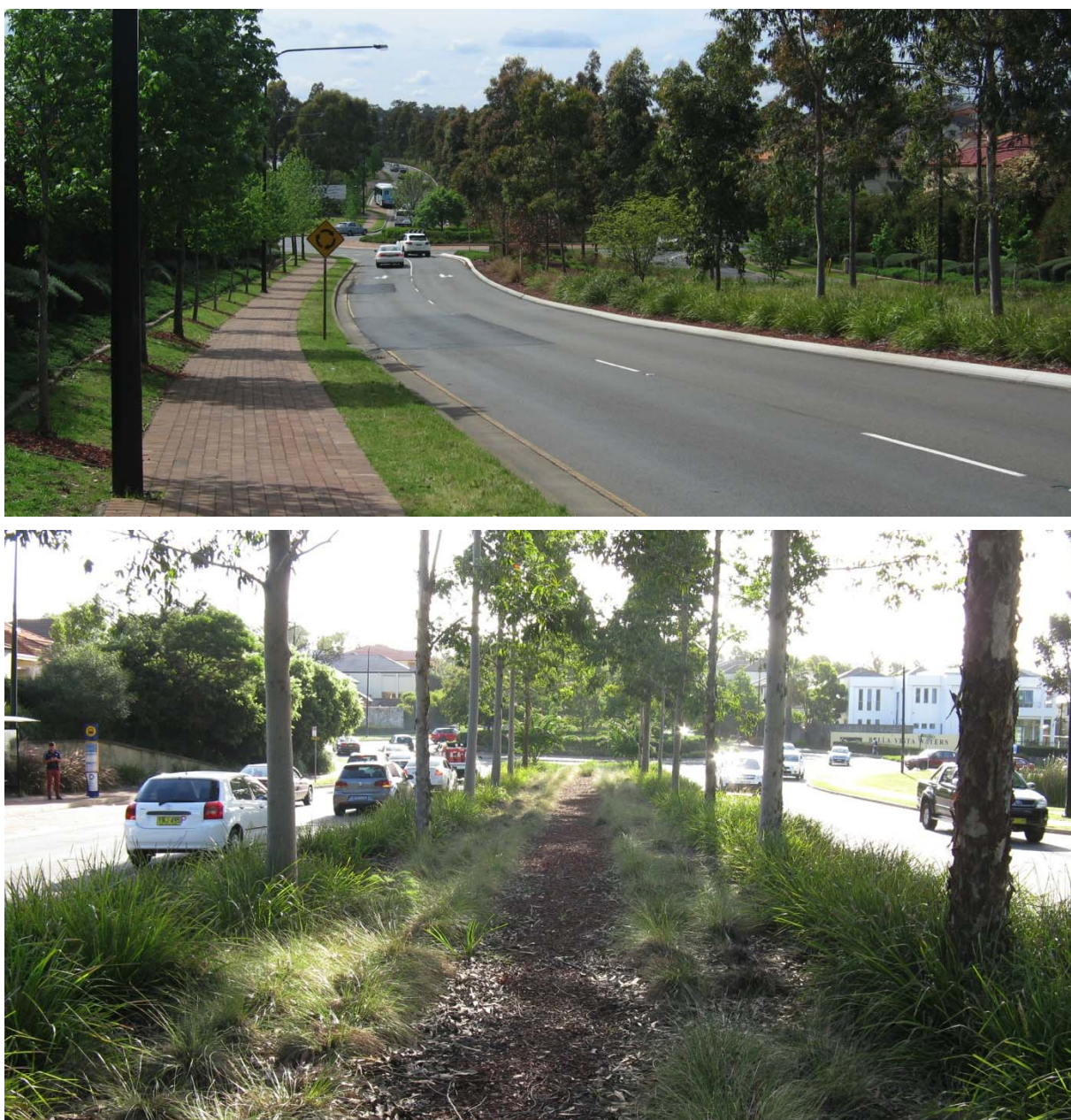
Fig. 2 Photographs of Norwest Boulevard, Sydney, Australia (July, 2015)

The corridor is heavily landscaped and has a particular visual appeal. The central median has semi-mature gum trees planted at regular intervals in two rows within a planted zone of 9.0 m in width. The bare tree trunks, tree canopies that are regularly-spaced, and ground-level cover (Fig. 2) are dominant features that are worthy of preservation or replication.