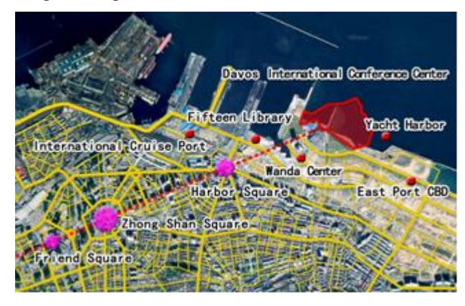
Fig. 1 Davos square location

The Davos Square includes a marine landscape platform and the second largest musical fountain in China (Fig. 2). During the night, the Davos and surrounding have created a rich scenery, music fountain and waterfront activities attracting a large number of tourists and local residents. The Davos has become a great landmark, and its square which has largest scale in the eastern coastline is also an important place for public recreation and leisure.