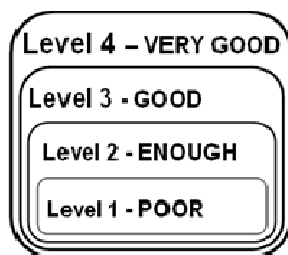
Fig. 2 Levels of Maturity for the Assessment of RCM Software

In the case of the RCM software evaluation tools, we can estimate the level of maturity of software using the SCAMPI appraisal method. This method [28] allows establishing a functional block classification in four levels of maturity, depending on the criteria satisfied by the RCM software under study. For a block has a certain level of maturity, must meet the assessment criteria associated with that level and previous levels (Figure 2).