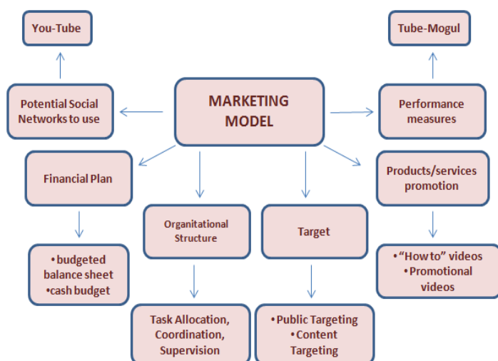
Fig. 3 SNeM 2 S applied to You-Tube

In order to describe how companies and consumers can use the SNeM 2 S for their marketing strategies, the model has been applied to You-Tube (as illustrate in Figure 3), as it is the largest video sharing website and the second biggest search engine on the Internet ( http://weblogs.hitwise.com/james-murray/2011/07/google_accounts_for_92_of_uk_s_1.html ).