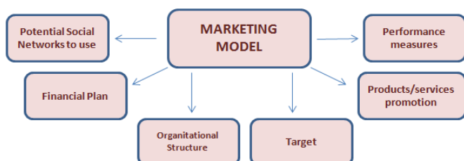
Fig. 2 SNeM 2 S structure

The first step consists of a selection of potential Social Networks to use. Companies should select the right Social Networks for their marketing strategies based on what outcome they are looking for. The i-Prospect Search Marketer Social Networking Survey conducted by Jupiter Research, asserts that almost half of the marketers surveyed had